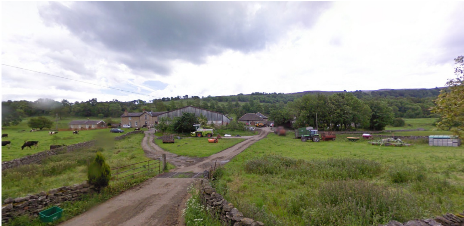
Figure 1: Image indicating level difference between Access Track and Proposed Development

The image below indicates the reason why no flooding occur higher than the access track. There is a considerable difference in levels (available upon request) with the proposed property being at one of the highest points on Sorrelsykes farm causing little and no concern about flooding directly to the property